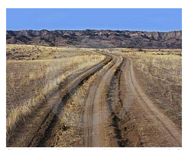
So who built those old rutted roads? Imperial Rome built the first long distance roads in Europe (including England) for their legions. Those roads have been used ever since.