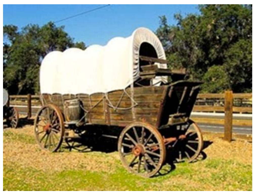
Why did the wagons have that particular odd wheel spacing? Well, if they tried to use any other spacing, the wagon wheels would break on some of the old, long distance roads in England, because that's the spacing of the wheel ruts.