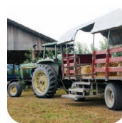
Farms and Ranches