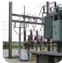
Power Transmission and Distribution